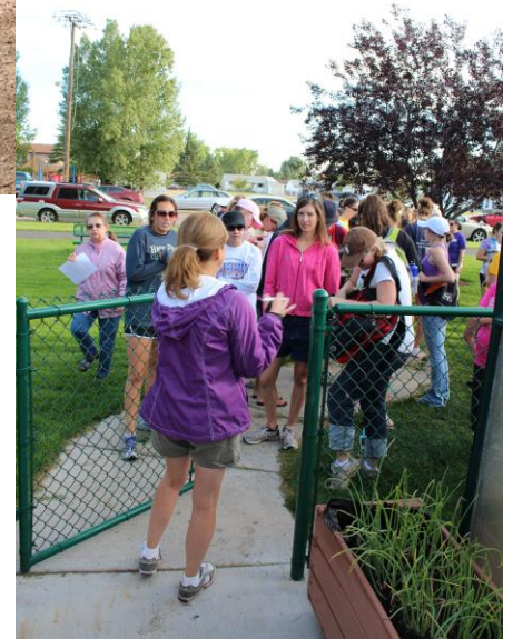
Breaking ground at LaBonte Park Community Gardens